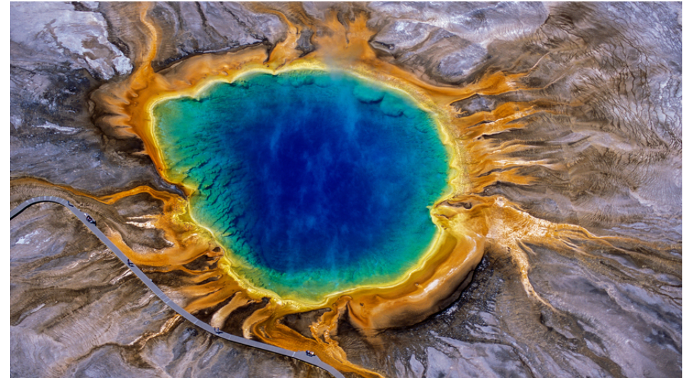
Grand Prismatic Spring is one of the largest and most beautiful examples of a common hydrothermal feature in Yellowstone National Park.

By National Geographic, adapted by Newsela staff on 10.26.17 Word Count 704 Level 840L